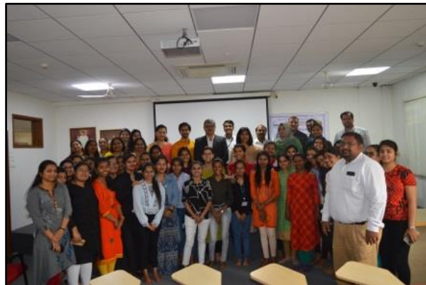
Participants of State Level Seminar