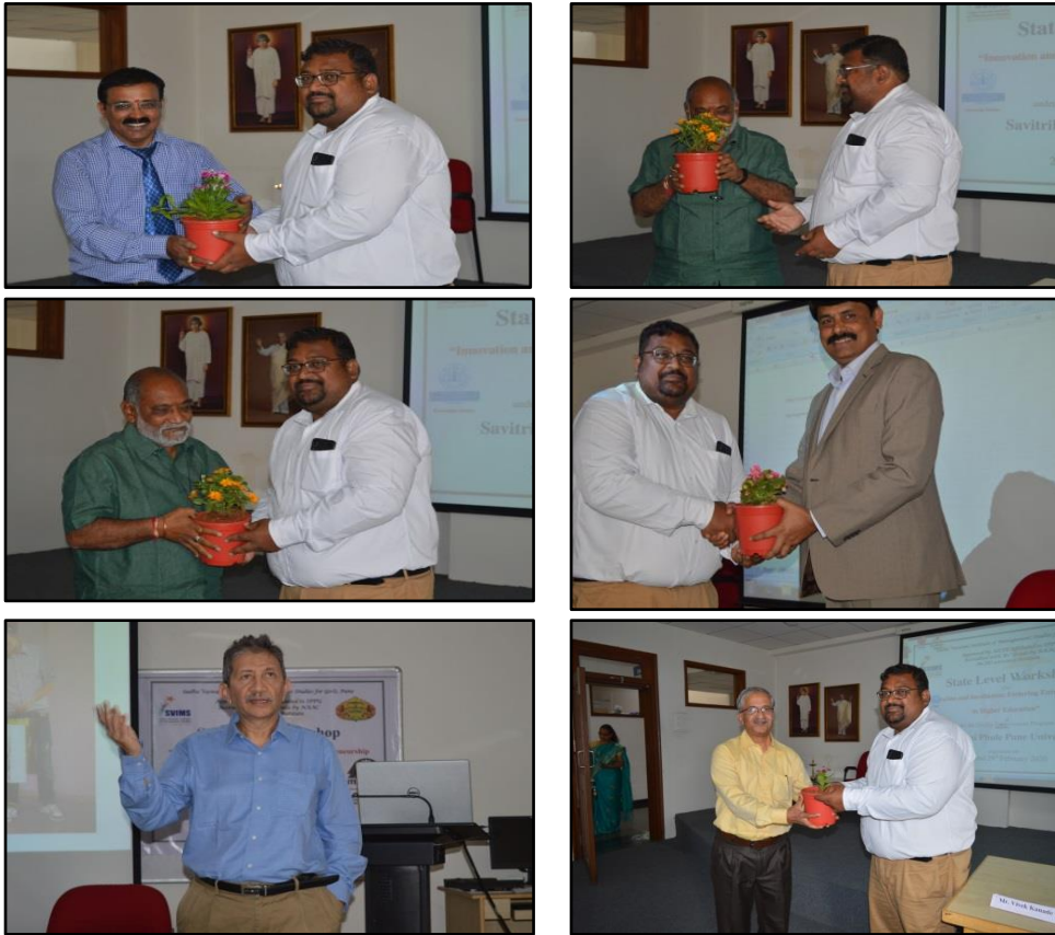
Resource persons delivering Lecture during the State Level Seminar Day 1