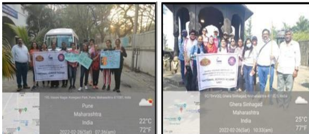
Students involved in Fort Claening