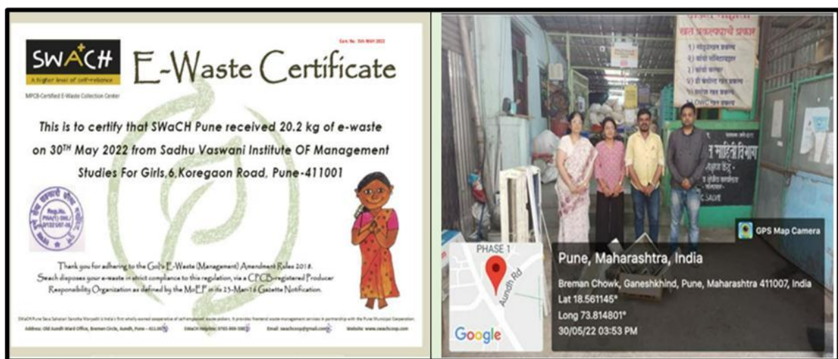
Donation of E-waste at Swachh Center in Aundh