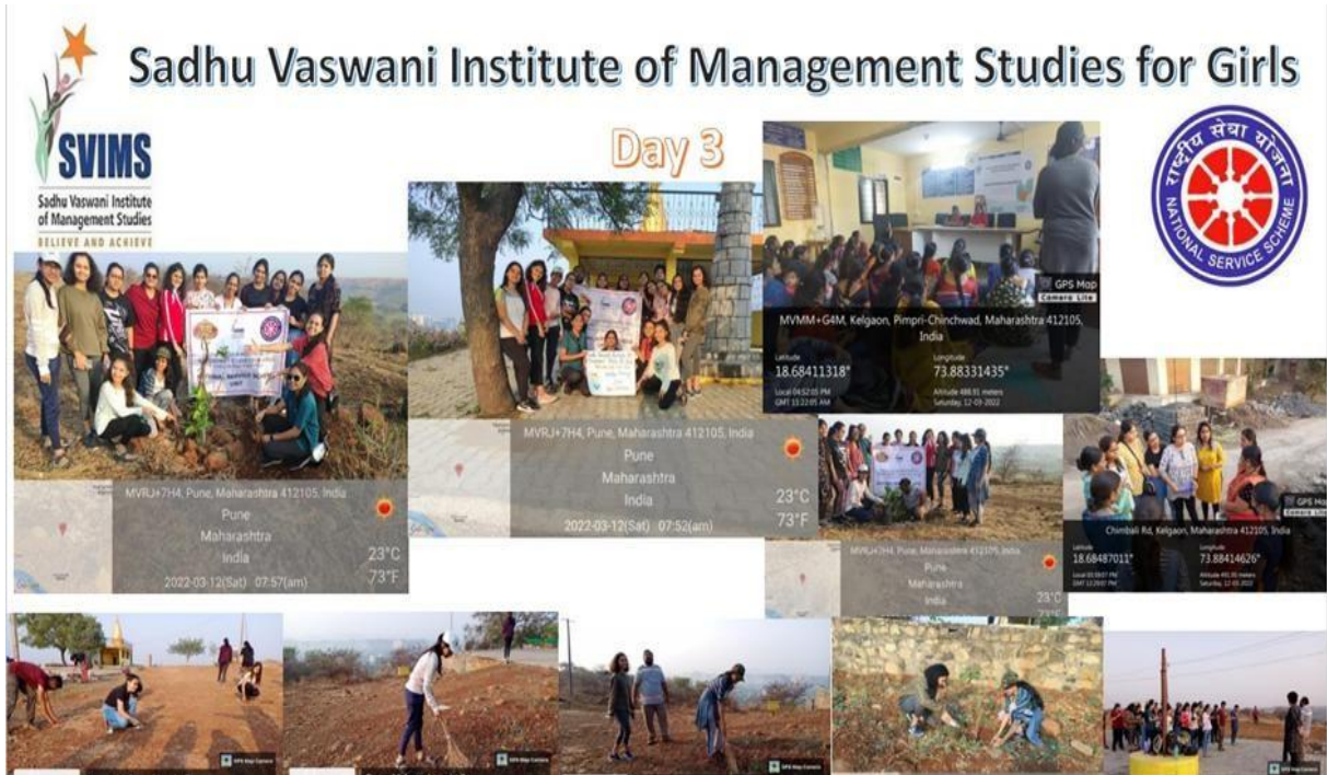
Students involved in cleaning, tree plantation and tree watering activities.

Performed street play about the clean India, Save our Heritage, Plastic free India and involved the people how was there for exercise. There students did cleaning, tree plantation and tree watering activities.