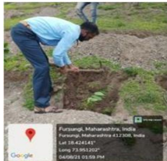
Tree Plantation at Holkarwadi forest land, Phursungi, Pune