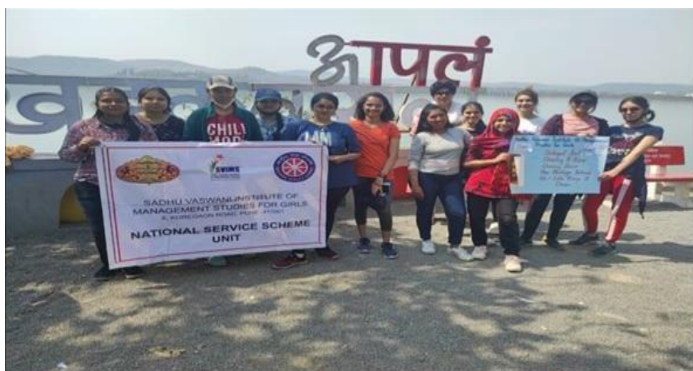
Students involved in River Cleaning at Khadakwasla