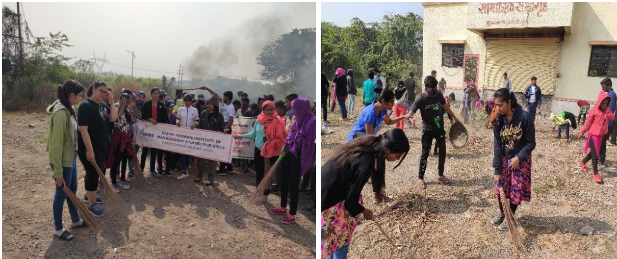
Cleaning Drive at Phulgaon

During the NSS Camp at Phulgaon, volunteers carried out a Campaign - Swachh Bharat Abhiyaan on 20 th January 2020 at Satyasai Seva Centre, Vitthal Mandir, Shani Mandir and Bairav Nath Temple areas, Kamini Ghat, Bhima Nadi Ghat and Mahadev Ghat areas, Ganpati Mandir [ Malwadi Phulgaon], Shrutisagar Ashram.